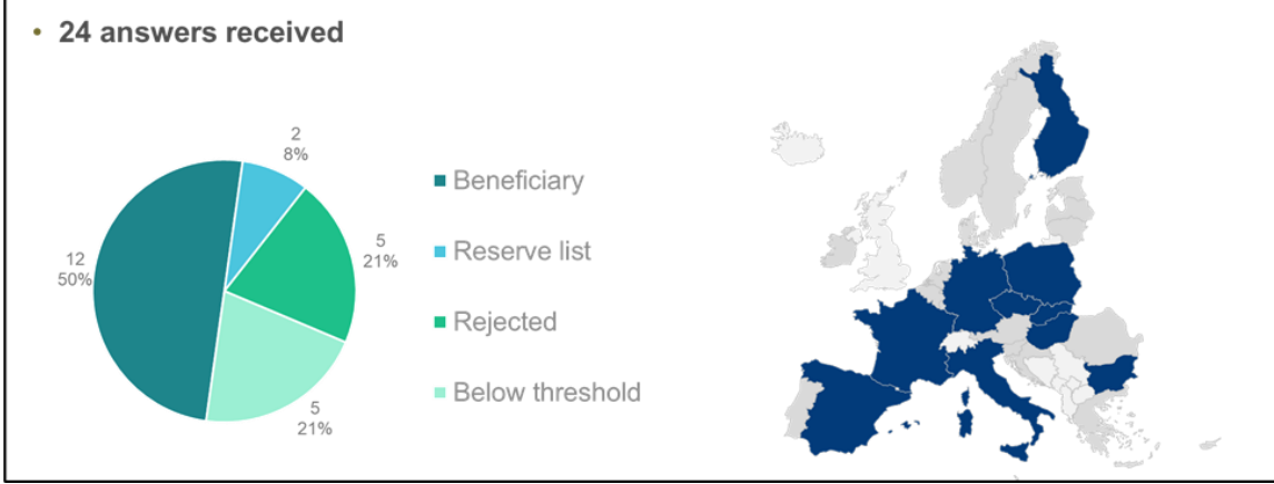
Fig 2: Feedback received from ASAP applicants